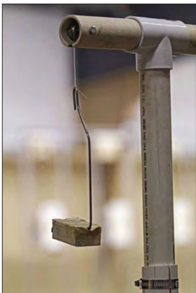
Artificial support like this T-stand is allowed in the standing supported position.